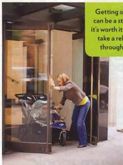
Getting out the door can be a struggle—but it's worth it to be able to take a relaxed stroll through the park.